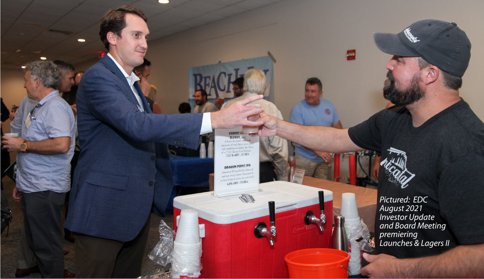
Pictured: EDC August 2021 Investor Update and Board Meeting premiering Launches & Lagers II