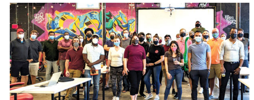
Pictured: A crowd of participants and volunteer mentors at Groundswell Startups

In addition, the EDC partnered with The Florida High Tech Corridor , a 23-county region spanning from the Sun Coast to the Space Coast where research and innovation thrive, to promote regional programs and success stories.