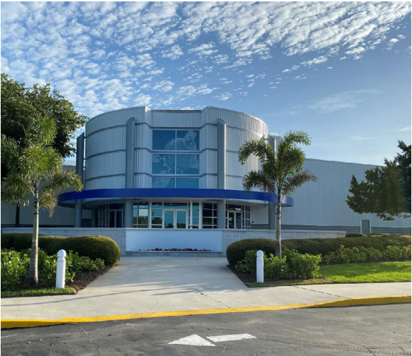
Pictured above: Lockheed Martin S.T.A.R. Center in Titusville

“ A resilient, sustainable, world-class economy is what we’ve been building for the last decade on the Space Coast and although we did not expect it to be tested by the headwinds of a global pandemic, we are gratified to see the momentum continue. Florida’s Space Coast is on the national radar as a diversified, high-tech center that can lay substantial claim to the growing aerospace and defense sectors. ”