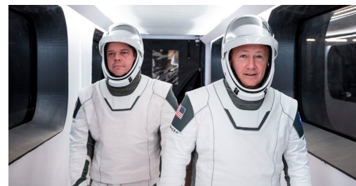
Pictured above: Embraer Phenom 300MED jet model to be produced in Melbourne, FL; NASA astronauts Bob Behnken and Doug Hurley.