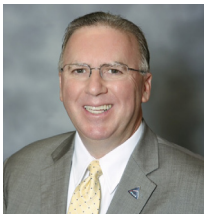
Joseph T. Mayer Chair