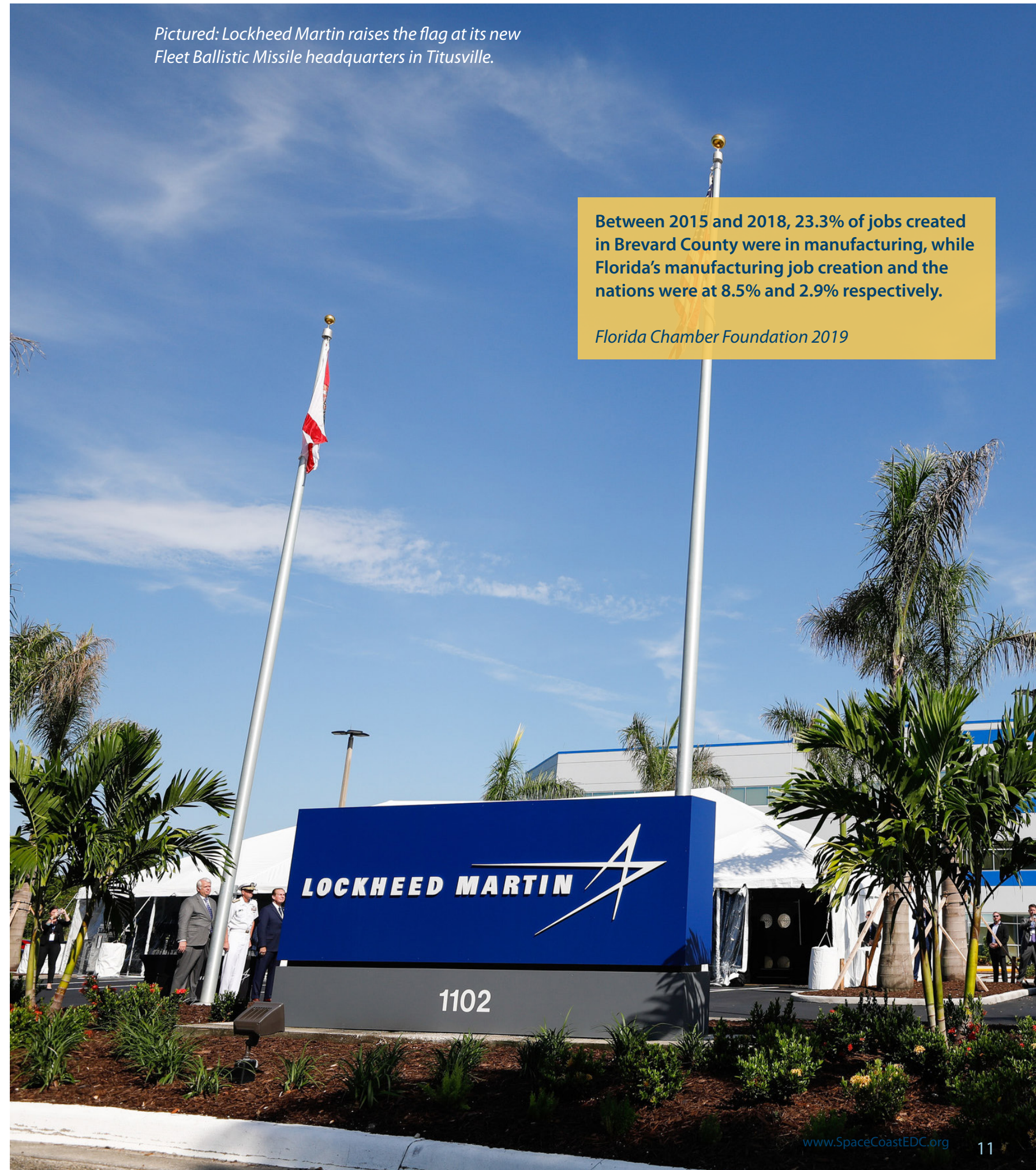
Pictured: Lockheed Martin raises the flag at its new Fleet Ballistic Missile headquarters in Titusville.

Between 2015 and 2018, 23.3% of jobs created in Brevard County were in manufacturing, while Florida's manufacturing job creation and the nations were at 8.5% and 2.9% respectively.